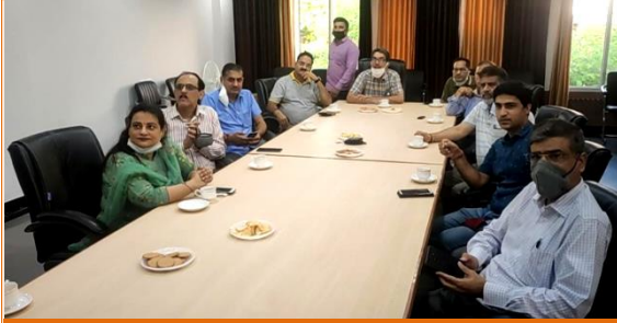
Engineers attending Royal Charters' Day 2020