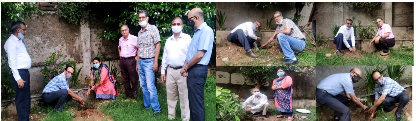
Glimpse of Plantation Drive at IEI Jammu Local Centre