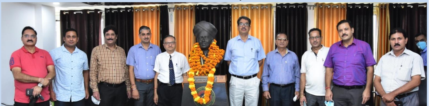
Engineers posing for a photograph on 53rd Engineers' Day Celebrations