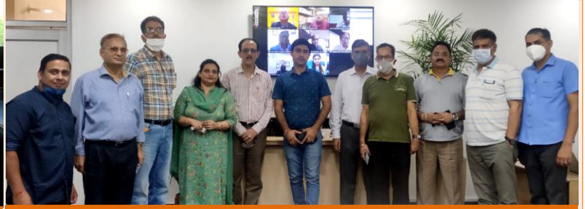
Engineers posing for a photograph on Royal Charters' Day 2020

The Institution of Engineers (India), Jammu Local Centre celebrated "Royal Charter Day" on 9 th Sep 2020 as a Statutory Day of the Institution through Google meet. A large number of engineers from various organizations participated in a virtual mode keeping in view the COVID-19 restrictions. Chairman of the Centre, Dr. Sanjay Khar, FIE while welcoming the guests informed that this day is celebrated by IEI all over the country to commemorate the incorporation of The Institution of Engineers (India) by Royal Charter on September 9, 1935 by King and Emperor George V at the Court at Buckingham Palace, London and remains the only professional body in India to be accorded this honour. This endowed the Corporate Members of the Institution with the right to use the title 'Chartered Engineer' after their names, implying that they are qualified engineers deemed worthy to hold a Charter.